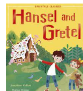
Hansel and Gretel