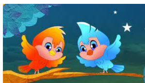
Two Little Dicky Birds