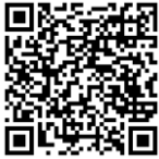
On the way to... activity

Remember, all the activity cards are available in Bengali, Gujarati, Urdu, Polish and Ukrainian; let us know if you would like a copy!