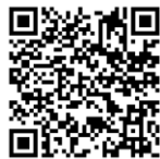
On the Way to... bingo