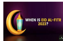
What is Eid al-Fitr?