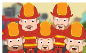
Five Little Firemen