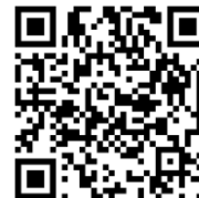
What the Ladybird Heard